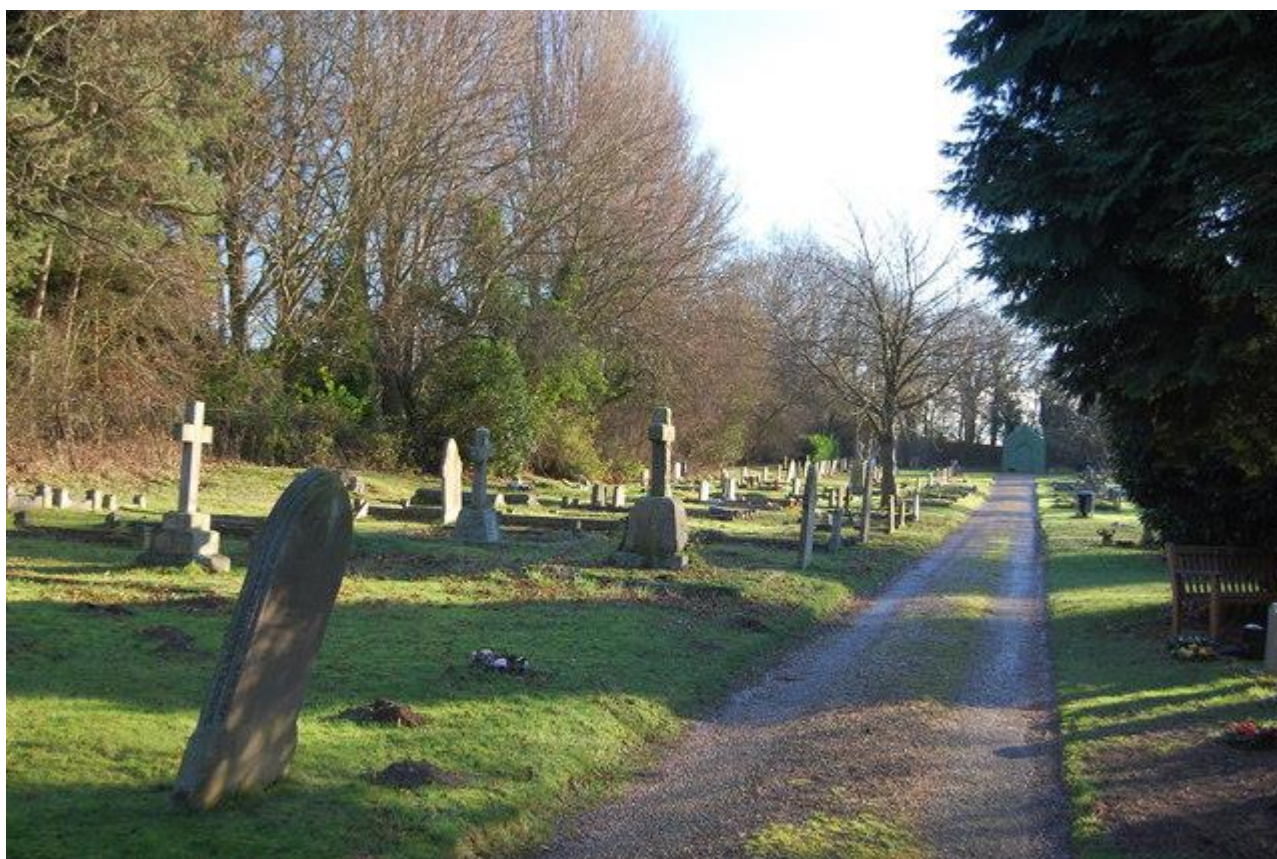
Elmswell Cemetery, Suffolk

Elmswell Cemetery, Suffolk contains three War Graves, two from World War 1 & one from World War 2.